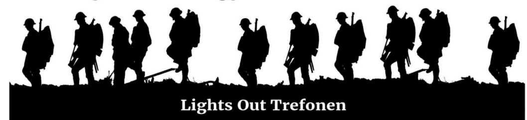
Lights Out Trefonen